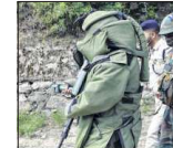
Security forces during a search operation for IEDs in Kishtwar.